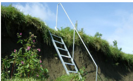
The prototype ladder at Tal-y-Cynllwyn

The club has purchased a prototype galvanised metal ladder that will help anglers gain access from the high banks at Tal-y-Cynllwyn. Three more are to be made and situated in appropriate spots next season.