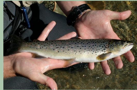
A typical wild brownie from Claerwen

Wild Browns – Claerwen, Elan Valley, Rhayader